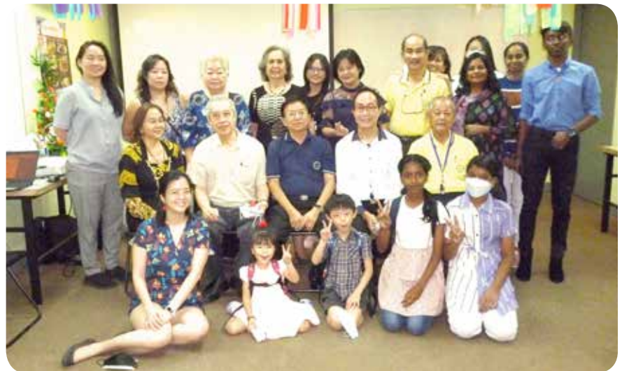
Guests and members at Tanabata 2022.