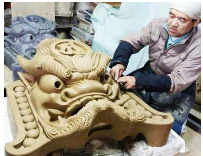
A Japanese craftsman carefully carving a fierce-looking Onigawara.