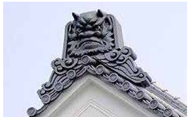
Onigawara on the roof of Tokyo National University of Fine Arts and Music.

Like people all over the world, despite their ultra-modern, progressive technological outlook, the Japanese people are basically still very traditional and superstitious in nature. They can be often found thronging in temples and shrines, seeking divine interventions for their work, businesses, marriages, education as well as ill health and other issues.