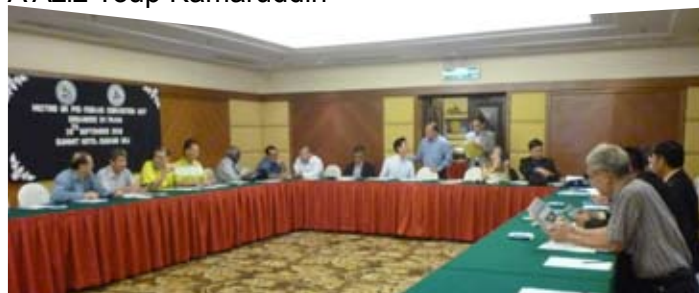
Participants in discussion at pre-FOSAAS meet.