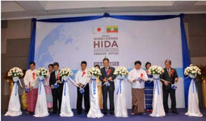
Ribbon cutting ceremony by the VVIPs