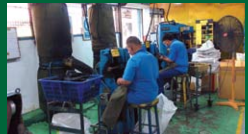
A section of Kulitkraft Sdn. Bhd.