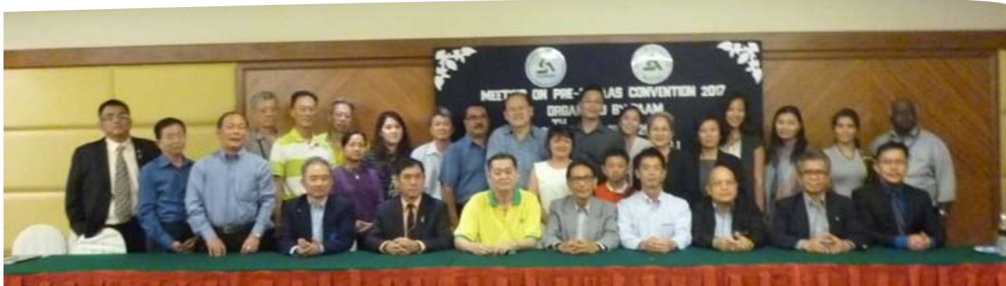
Pre-FOSAAS: 29 Sept 2016 @ Summit Hotel, Subang, Malaysia.