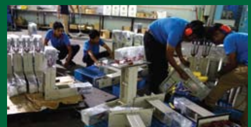
Staff at work at Henikwon Corp Sdn Bhd