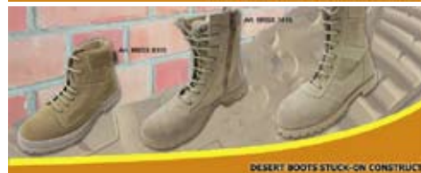
DESERT BOOTS STUCK-ON CONSTRUCTION