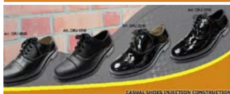
CASUAL SHOES INJECTION CONSTRUCTION