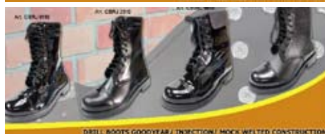
DRILL BOOTS GOODYEAR / INJECTION / MOCK WELTED CONSTRUCTION