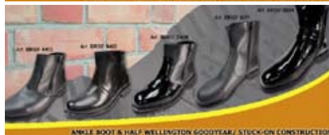
ANKLE BOOT &amp; HALF WELLINGTON GOODYEAR / STUCK-ON CONSTRUCTION