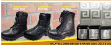
MALAYSIA GOOD DESIGN AWARDS 2010, 2012 &amp; 2013