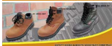
SAFETY SHOES &amp; BOOTS GOODYEAR CONSTRUCTION