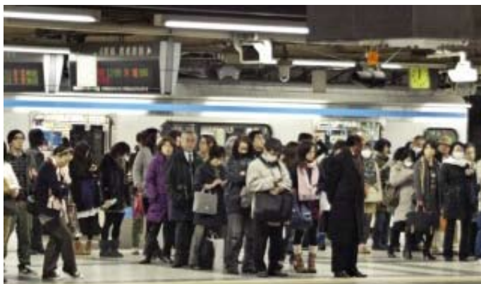
When Waiting for Trains at the Tokyo Train Stations...

Indeed we, the foreigners, cannot go away without the impression that the Japanese people are generally a hardworking, disciplined, happy and dedicated lot.