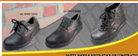
SAFETY SHOES &amp; BOOTS STUCK-ON CONSTRUCTION