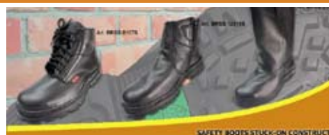
SAFETY BOOTS STUCK-ON CONSTRUCTION