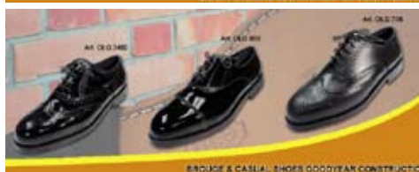
BROUZE &amp; CASUAL SHOES GOODYEAR CONSTRUCTION