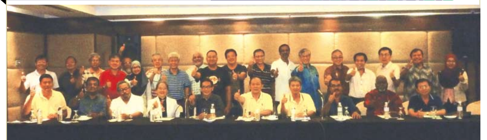
32<sup>nd</sup> Annual General Meeting at Holiday Inn, Glenmarie - 23<sup>rd</sup> April 2017