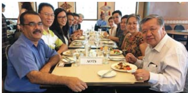
PAAM committee members having lunch with representatives from Penang