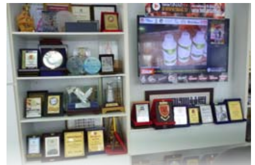
Hall of awards