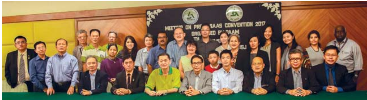
Group photo of delegates from the Alumni Societies of Vietnam, Thailand, Philippines, Myanmar, Indonesia, ABK/AOTS Penang and Malaysia

(KDN PQ1780/3427) No 33, Jalan Hang Tuah 2, Taman Salak Selatan, 57100 Kuala Lumpur. Tel: 03-7956 3422