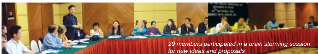
29 members participated in a brain storming session for new ideas and proposals