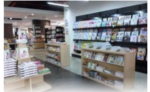
Souvenir and bookshop