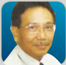
By A Aziz Y Kamaruddin (Nutritional Medicine Practitioner)