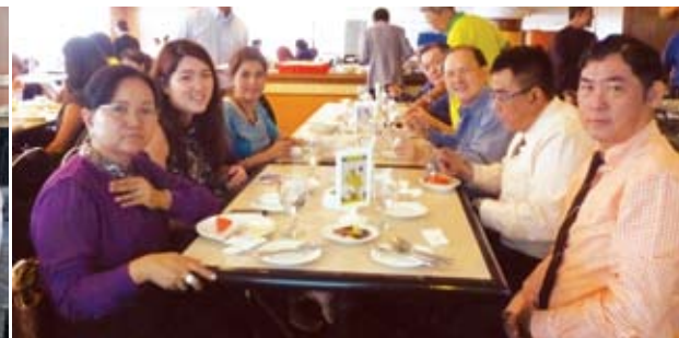
The participants from HIDA Myanmar Alumni Association and some members at lunch in Summit Hotel