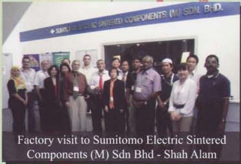
Factory visit to Sumitomo Electric Sintered Components (M) Sdn Bhd - Shah Alam