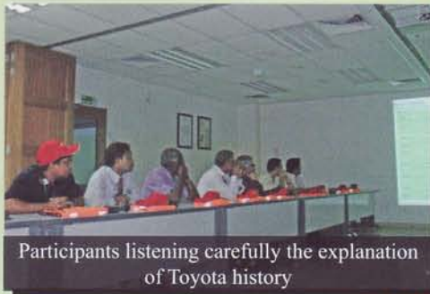
Participants listening carefully the explanation of Toyota history