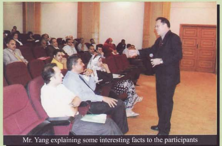
Mr. Yang explaining some interesting facts to the participants