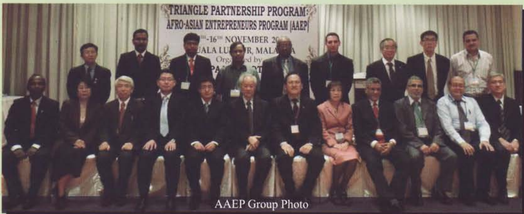
AAEP Group Photo