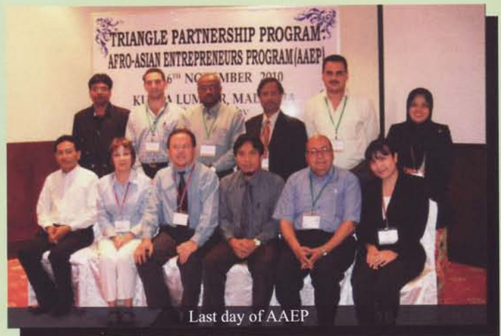
Last day of AAEP

The Organising Committee took six months to plan and eventually was able to successfully implement the following course schedule:-