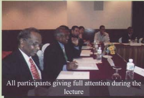
All participants giving full attention during the lecture