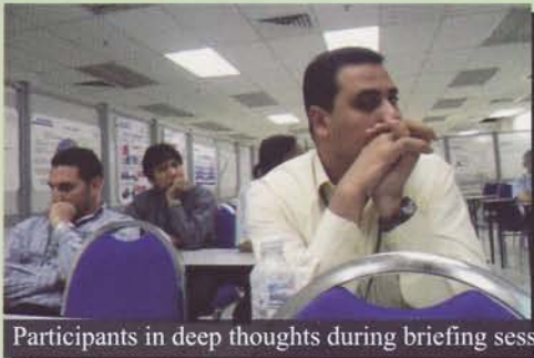
Participants in deep thoughts during briefing session at Autolive Hirotako Sdn Bhd (Seri Kembangan)