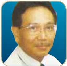
By A Aziz Y Kamaruddin (Nutritional Medicine Practitioner)

When preparing a Green Tea drink, allow for an 8-to 10-minute brewing time , which allows adequate extraction of the catechins (anti-cancer compounds). Always drink freshly brewed tea, and space out your daily cups equally.