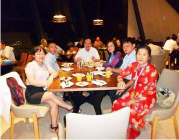
Dinner at The Trace Restaurant after the convention