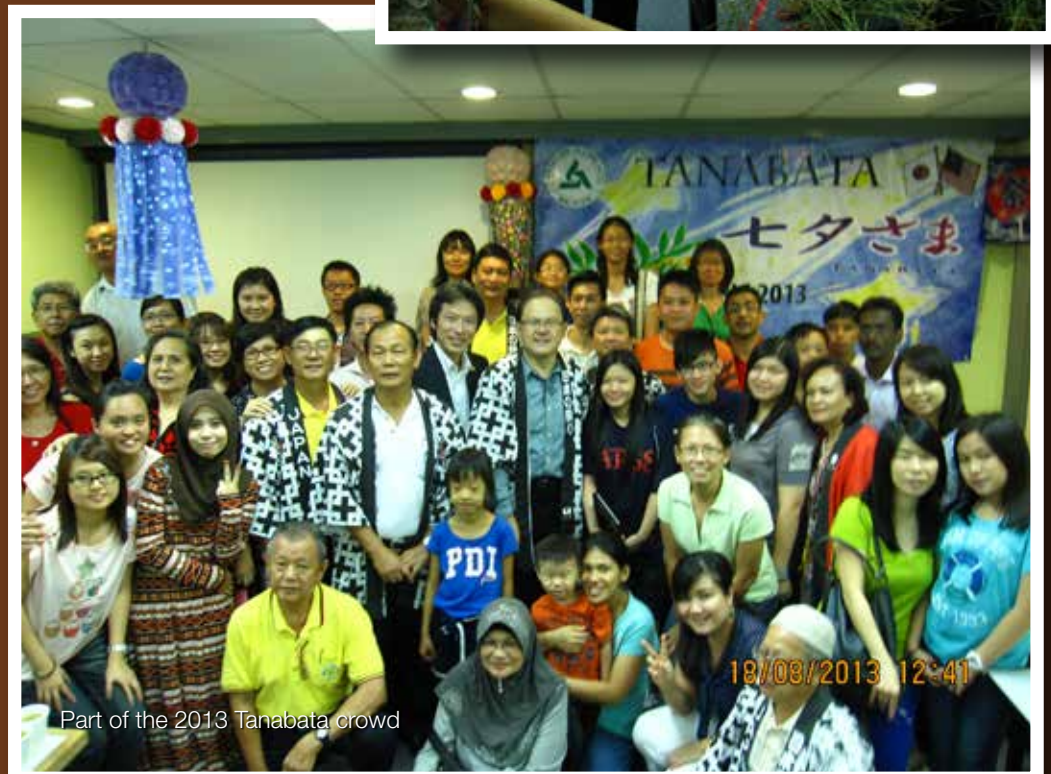
Part of the 2013 Tanabata crowd