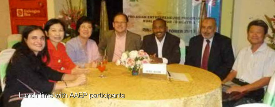
Lunch time with AAEP participants