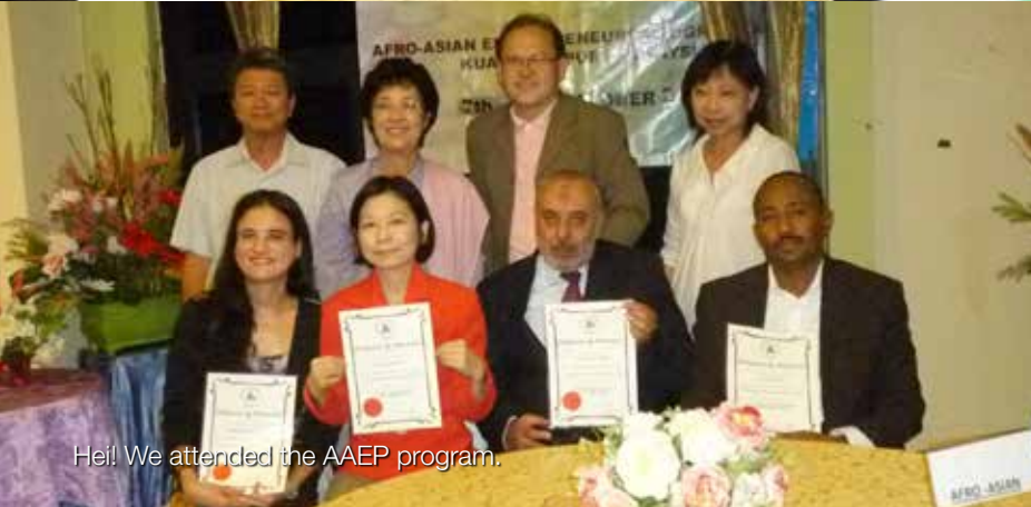
Hi! We attended the AAEP program.