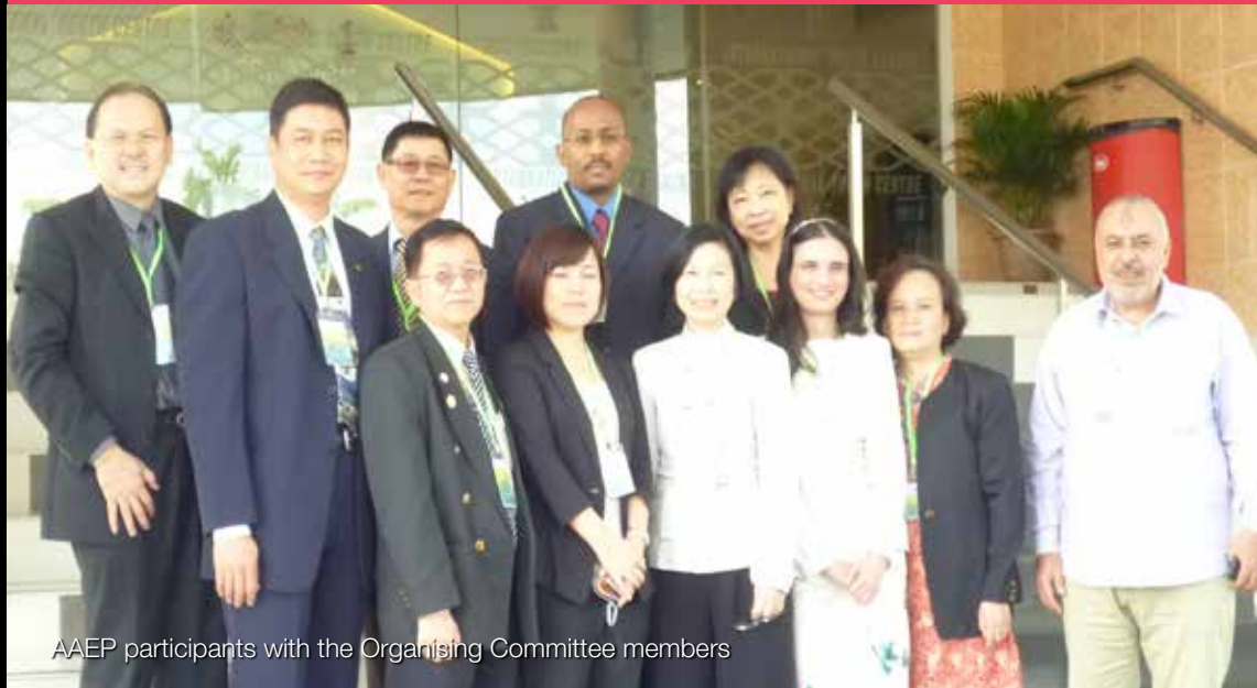
AAEP participants with the Organising Committee members