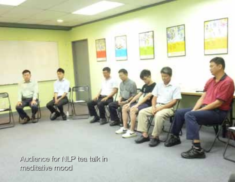
Audience for NLP tea talk in meditative mood

The discussion revolved around HIDA's plans for embarking on strategically collaborative alliances with AOTS Alumni Societies for the success of the initiatives.